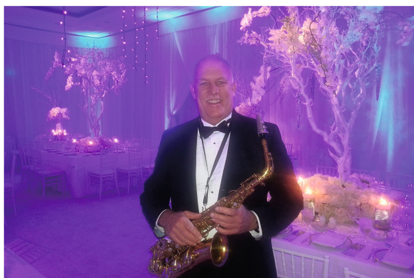
At a big band gig.